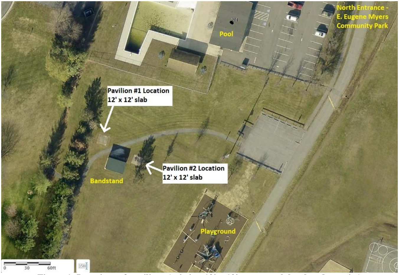
Figure 1: Locations of pavilions (existing 12' x 12' concrete slabs already on site)