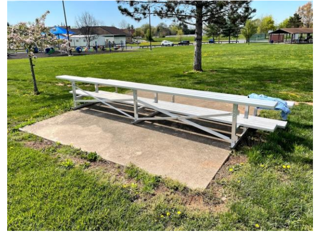
Figure 3: Pavilion #2 Location

(Note: Bleachers are not permanent structures; they will be moved off slabs by Town Staff for project)